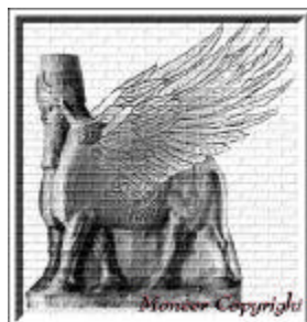
The Assyrian statue

In Nimrud for example, statues and inscriptions of a bull's body with man's head and eagle's wings are portrayed. These huge statues stand near the entrance to royal palaces – they symbolized the sovereign's terrible power of life and death.