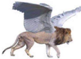
The first beast of Daniel 7

The first was like a lion, and had eagle's wings: I beheld till the wings thereof were plucked, and it was lifted up from the earth, and made stand upon the feet as a man, and a man's heart was given to it". (Daniel 7:3-4)