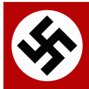
Hitler's pagan sun symbol

But so was Hitler – he was far more vicious than previous dictators and more neo-pagan. He was also more successful and was on the verge of world conquest. His biggest mistake was in invading Russia rather than working with them and leaving millions of troops to finalise the conquest of North Africa. Peoples in Iraq and Iran viewed him as a friend and would have happily joined forces with him in the planned invasion of India with Japan.